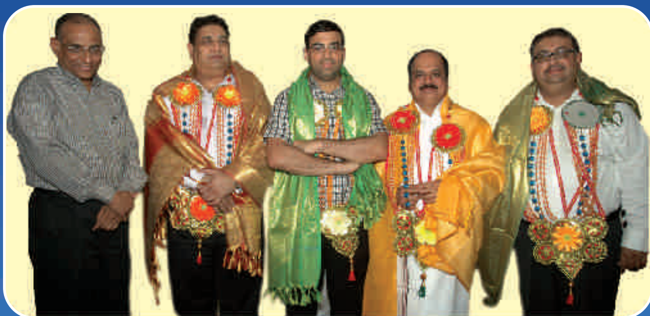
The New AICF Team